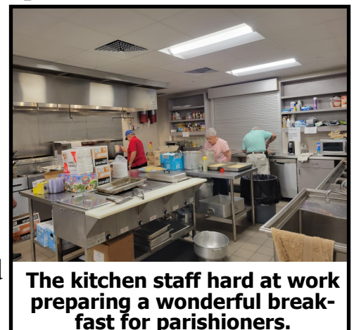
The kitchen staff hard at work preparing a wonderful breakfast for parishioners.

The Pancake Breakfast is offered at no cost to anyone who wishes to attend. Donations are accepted and welcome. All proceeds go to SGG Parish. The next pancake Breakfast is December 12th.